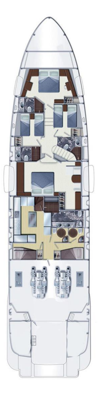
M inor design changes to saloon and flybridge seating have not been reflected on the layout plans. Please view yacht photos for details.